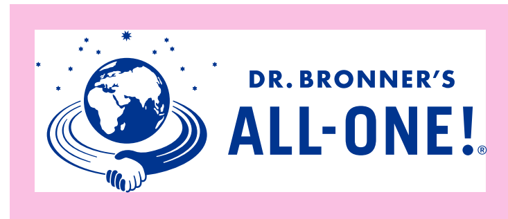
Minimum clearance for stars