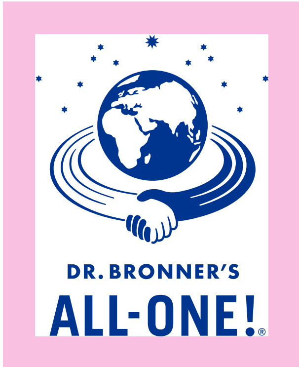
Minimum clearance for stars