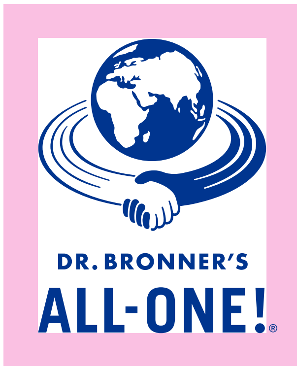
Minimum clearance without stars

The logo with stars is preferred. However, when the minimum clearance for stars is not available, you can use a version without the stars.